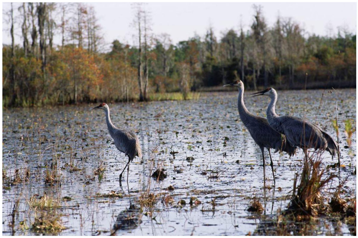
Sandhill cranes in Okefenokee Wilderness.